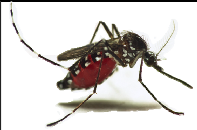
Dogs and cats get heartworm from mosquitoes